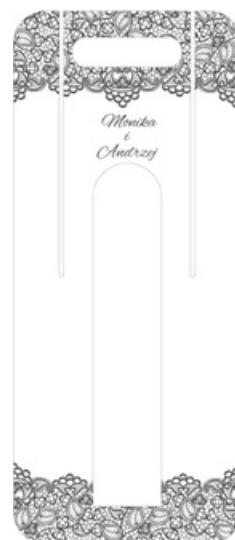
engraving number: grw05