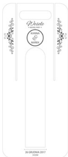
engraving number: grw04