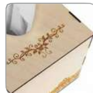
Decorative front and sides

Additional capabilities: We can cut the box out of colored plywood: dark brown, red, blue, green.