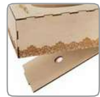
Opens from the bottom